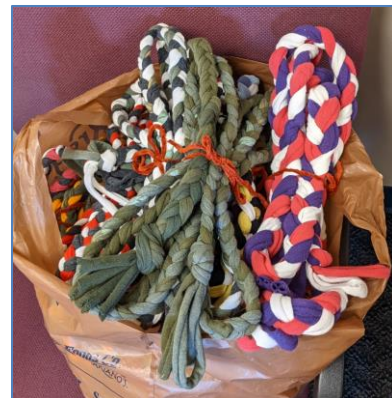
T-shirt braided jump ropes