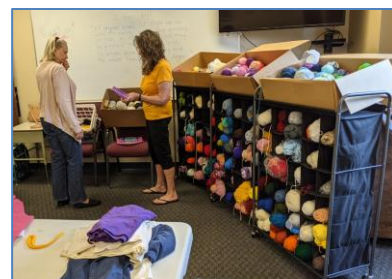
Knitting with Looms

Please join us on the third Monday of each month in Room 223. You can drop in any time between 10am-2pm. We can teach you, or you can bring your own project to work on. Watch for announcements in the bulletin.