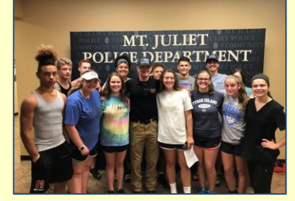
Youth delivering baked goods to local police and fire stations

Lottie Moon Christmas Offering for International Missions Our Church Goal: $55,000