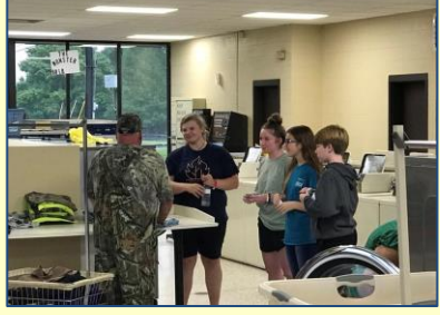
Youth serving at local laundry mat