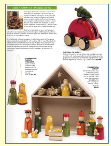
WMU WorldCrafts online purchases through 11/30 benefit Begin Anew of Middle TN with code TGNOV at www.worldcrafts.org!