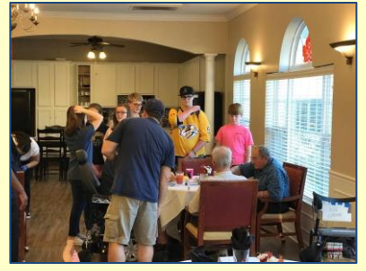
Youth visiting a local nursing home