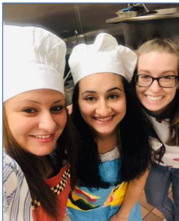
Every year we do an ESL class project, and this past year we created a cookbook. We had a fun time dressing up for the book!