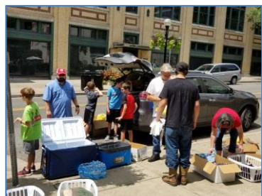
TGBC members distributing items to Nashville's homeless on Aug. 10