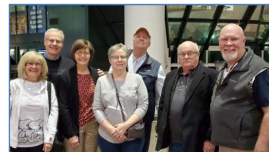
Dominica Mission Team

We also were part of a Bible study where we witnessed two Muslims come to faith. This is a very rare occurrence in this part of the world. We also heard another Muslim background believer (MBB) share his testimony of how he came to faith.