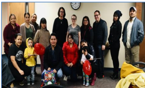
Our growing group before Valentine's Day. Say cheesy!

If you are interested in joining us, an individual language exchange partnership, or becoming a pen pal, please email carmen@esltulipgrove.org to see how we can plug you in.