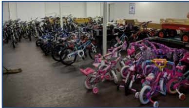
The GAs and RAs helped put together small bikes in November for our donation to the Nashville Baptist Association Toy Store where a total of 111 bikes were distributed!