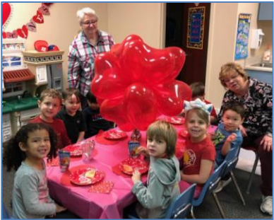
Mission Friends Valentine's Party