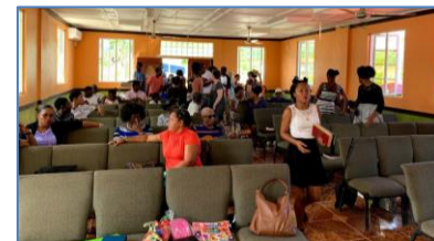
LaPlaine Baptist Church