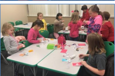
GAs playing games and making Valentine's for our church staff.