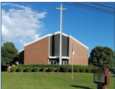
Grace Story Church meets at Lincoya Hills Baptist Church 3143 McGavock Pike Nashville, Tennessee 37214