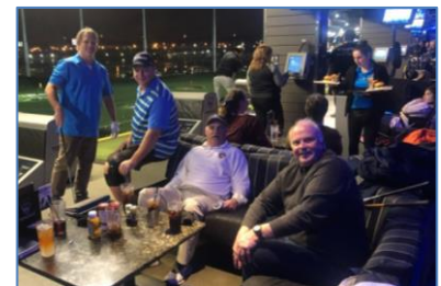
Tuesday night In His Grip group at TopGolf

Thank you, Tulip Grove, for hearts so big.