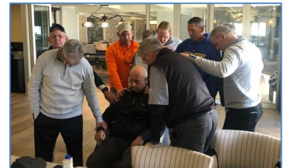
Old Hickory In His Grip group praying for a health concern for one of our own