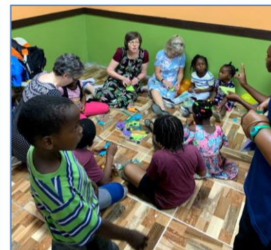
Our ladies working with the children (above) and providing EvangeCube training (below)