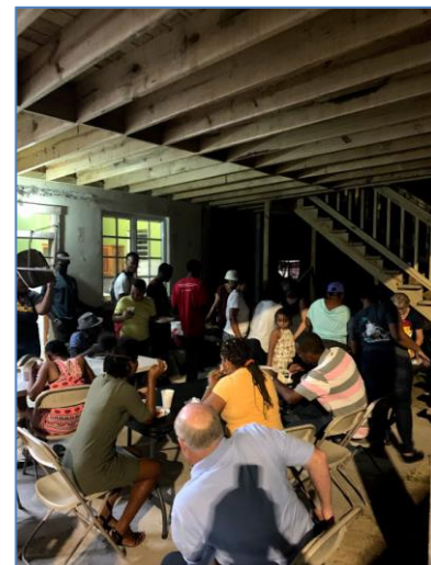
Fellowship under the new deck that our men helped build