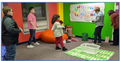
WoM Sisters Valentine Party at Begin Anew in Madison