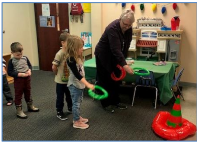
Mission Friends Christmas Party