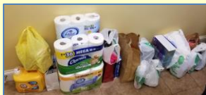
Items collected by WoM Sisters for Rest Stop Ministries

We will wrap up our 2018-19 year with fellowship at our May 7 meeting at Five Oaks Clubhouse in Lebanon. Plans are being made for a couple of summer missions projects such as a cooking class for the residents at Rest Stop Ministries and a back-to-school project for the Tennessee Baptist Children's Home in Brentwood. Our regular monthly meetings will resume in September for the new church year.