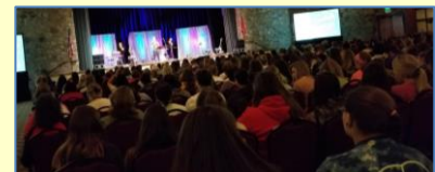
294 girls at Connection conference

The conference had over 1,500 total attendance. Mark your calendars now and make plans to attend next year’s conference March 20-22, 2020! Watch for more conference details as they are added at http://www.tnbaptist.org/gtcon2020