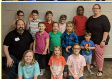
Several RAs and GAs helped serve at the April 13th Anna Luncheon