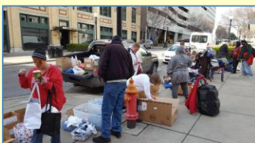
TGBC members distributing items to Nashville's homeless