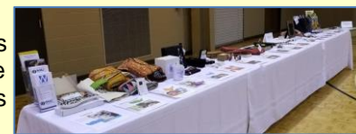
WMU WorldCrafts at the Ladies' Tea