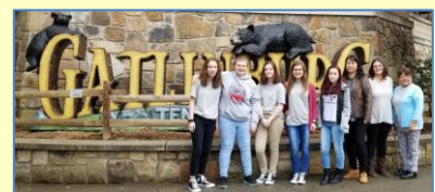
Tulip Grove women and youth girls