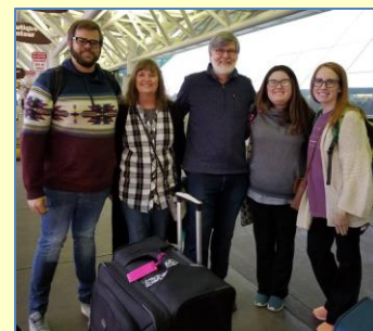
South Asia Team

Seeing the boldness of some of the local believers in South Asia has really encouraged me to live my life on missions no matter where I go.