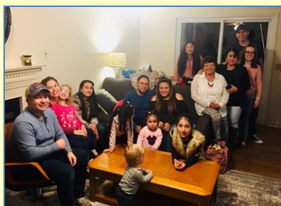
Our ESL classes love to eat. Here we are at our Thanksgiving dinner!