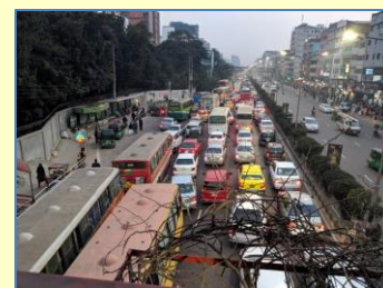
Traffic in South Asia